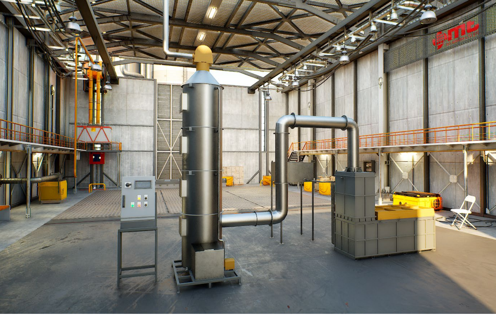
"YF-Series Medical Waste Incinerator"